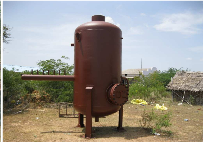
ATM Flash Tank-Shin Thermo Dynamic