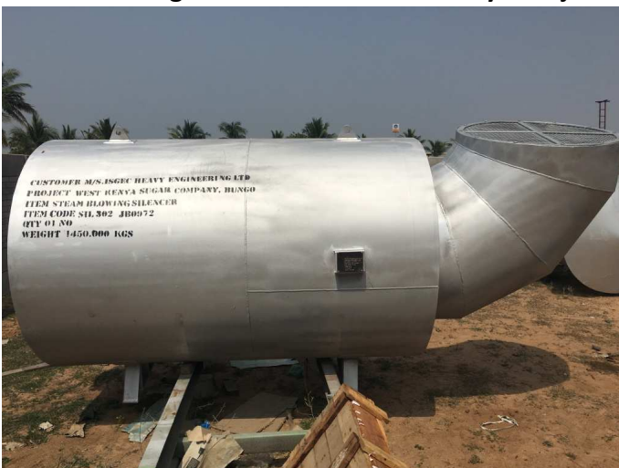
Steam Blowing Silencer ISGEC West Kenya Project