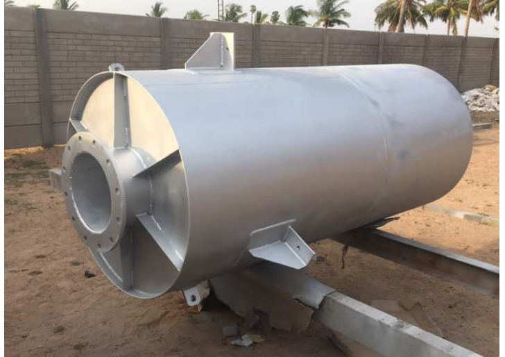
1.5MW Engine Ex.Silencer, M/s.Quippo Energy