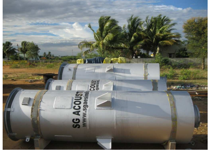
Steam Vent Silencers, M/s.Tyco Sanmar,Viralimali