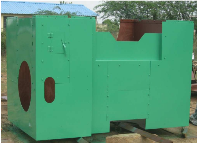
Lagging Cover for Steam Turbine