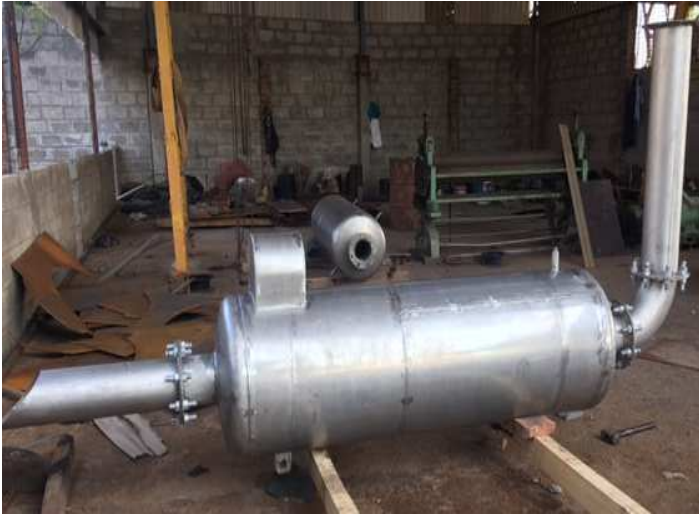
Stainless Steel Engine Ex.Silencer, M/s.Sulzer Saudi