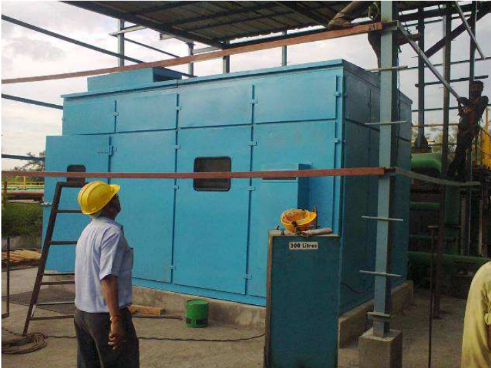
DG Enclosure, M/s.BK Birla Group, Gulbarga