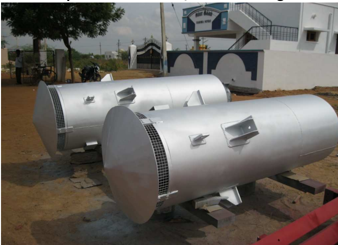
Warm-up Vent Silencer-M/s. NSL KSL Sugars