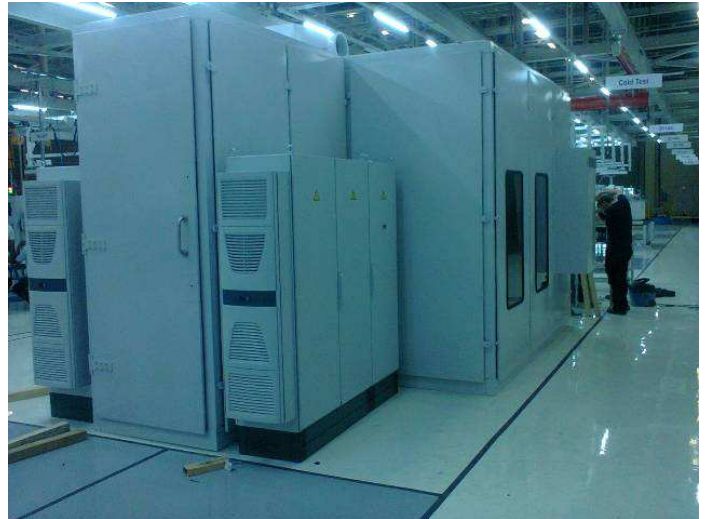
Cold Bed Test Enclosure, M/s.Volkswagen,Pune