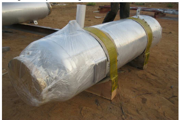
Nitrogen Comp. Discharge Silencer,M/s.Bhushan Steel