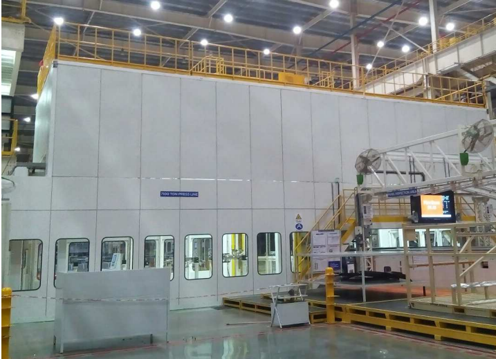
7100TON Press Line Enclosure, M/s.Ford India, Sanand