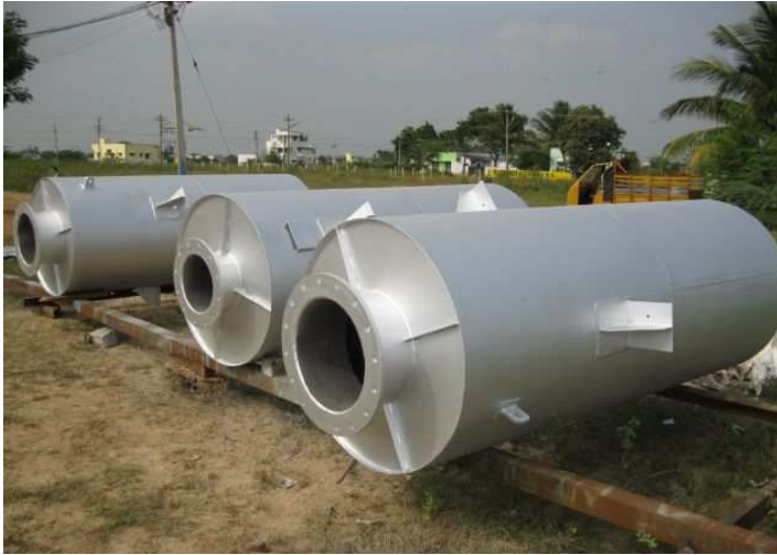
Engine Exhaust Silencers, M/s.Quippo Energy